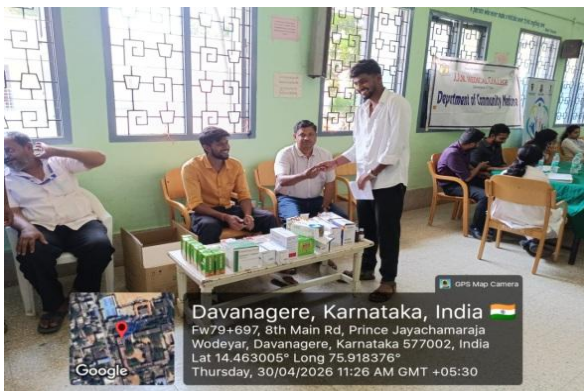
Davangere, Karnataka, India Fw79+697, 8th Main Rd, Prince Jayachamaraja Wodeyar, Davangere, Karnataka 577002, India Lat 14.463005° Long 75.918376° Thursday, 30/04/2026 11:26 AM GMT +05:30