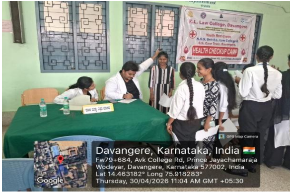
Davangere, Karnataka, India Fw79+684, Avk College Rd, Prince Jayachamaraja Wodeyar, Davangere, Karnataka 577002, India Lat 14.463182° Long 75.918283° Thursday, 30/04/2026 11:04 AM GMT +05:30