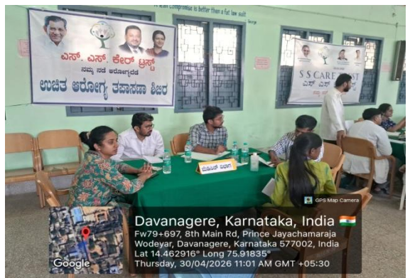
Davangere, Karnataka, India Fw79+697, 8th Main Rd, Prince Jayachamaraja Wodeyar, Davangere, Karnataka 577002, India Lat 14.462916° Long 75.91835° Thursday, 30/04/2026 11:01 AM GMT +05:30