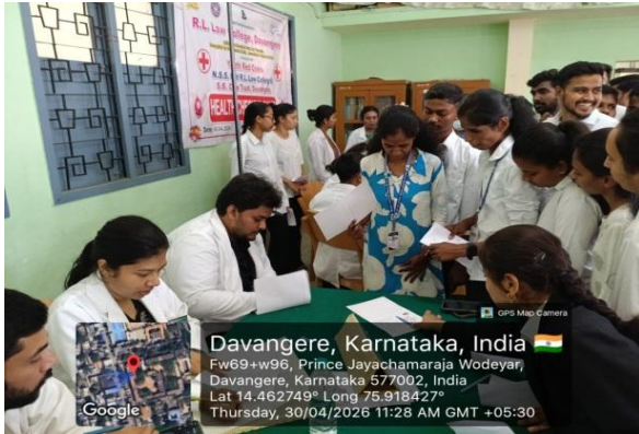
Davangere, Karnataka, India Fw69+w96, Prince Jayachamaraja Wodeyar, Davangere, Karnataka 577002, India Lat 14.462749° Long 75.918427° Thursday, 30/04/2026 11:28 AM GMT +05:30