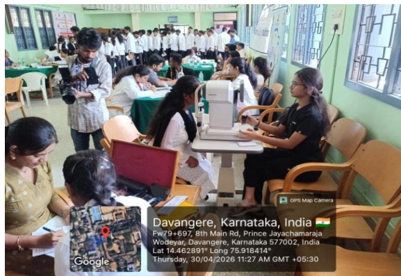
Davangere, Karnataka, India Fw79+697, 8th Main Rd, Prince Jayachamaraja Wodeyar, Davangere, Karnataka 577002, India Lat 14.462891° Long 75.918414° Thursday, 30/04/2026 11:27 AM GMT +05:30