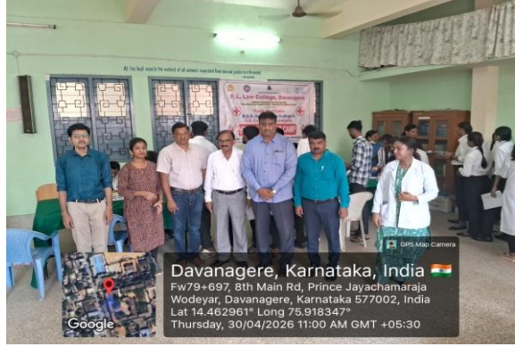
Davangere, Karnataka, India Fw79+697, 8th Main Rd, Prince Jayachamaraja Wodeyar, Davangere, Karnataka 577002, India Lat 14.462961° Long 75.918347° Thursday, 30/04/2026 11:00 AM GMT +05:30