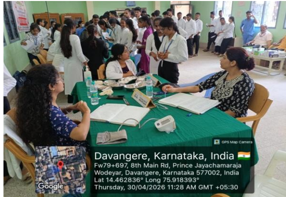
Davangere, Karnataka, India Fw79+697, 8th Main Rd, Prince Jayachamaraja Wodeyar, Davangere, Karnataka 577002, India Lat 14.462836° Long 75.918393° Thursday, 30/04/2026 11:28 AM GMT +05:30